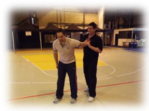
CPO Self Defence

Hostile Environment Awareness is an essential to preparing for operations and helps candidates understand the dangers of the Sun, wind and rain then investigates the human factors including violence and threat DRA's Tactical First Aid for Close Protection Officers is an essential and requires out of the box thinking as when you need it there may not be a comfy medical centre available.